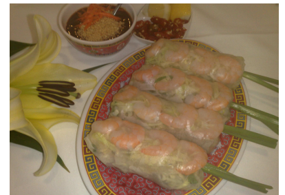
Transparent Prawn & Pork Roll