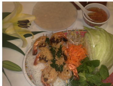
Grilled King Prawn with Salad