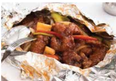
Flame Pork Ribs